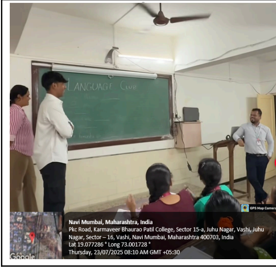
Navi Mumbai, Maharashtra, India Pkc Road, Karmaveer Bhaurao Patil College, Sector 15-a, Juhu Nagar, Vashi, Juhu Nagar, Sector - 16, Vashi, Navi Mumbai, Maharashtra 400703, India Lat 19.077286 ° Long 73.001728 ° Thursday, 23/07/2025 08:10 AM GMT +05:30