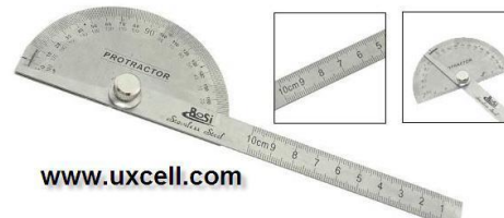
Stainless Steel Protractor & 10cm Ruler