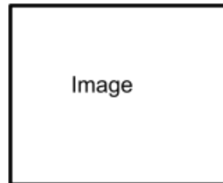
Caption for image