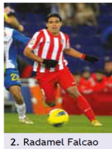
2. Radamel Falcao