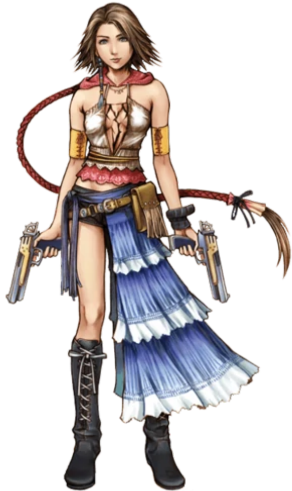
Ex: the skirt (Yuna from final fantasy)