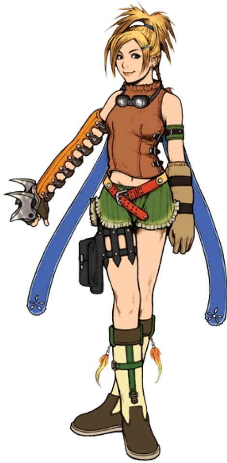
Ex: the two blue pieces of fabric on the back (Rikku from final fantasy)