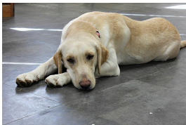
Breed: yellow lab