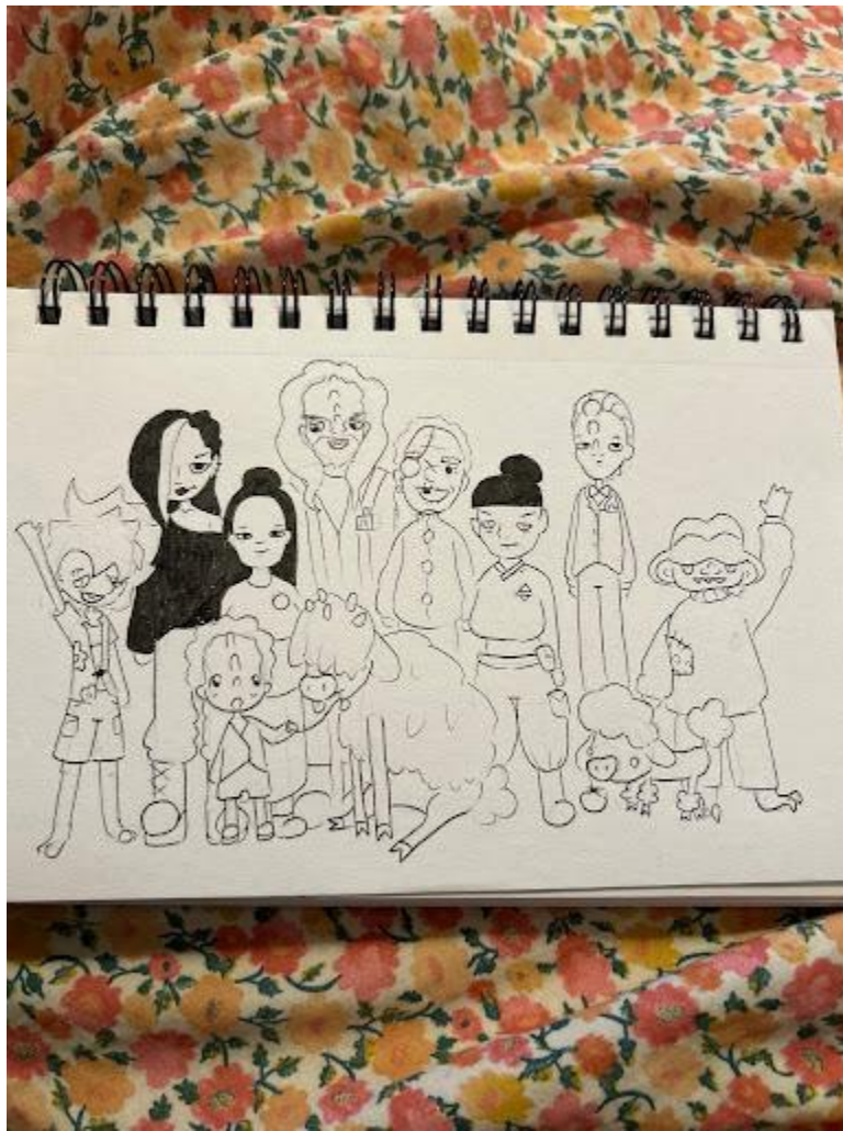
Basic Sketch of main cast