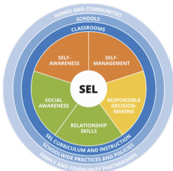
Figure 1: Framework for Systemic Social and Emotional Learning. ©CASEL 2017

recognizing emotions that surface and letting students know these emotions are ok and normal to have. During the lesson it is very important to monitor students closely by paying attention to their verbal and physical cues that reveal how they are feeling. Before the activity, you can assess students when they self-assess how they are feeling about having this conversation using the 'fist to five' strategy (fist-I'm uncomfortable 5-I'm ready to talk about this). Be sure to tell students they can ask to take a break or walk outside of the classroom if they are feeling overwhelmed.