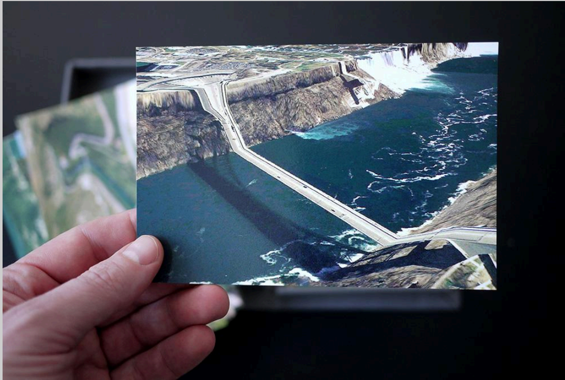
Clement Valla, Postcards from Google Earth , 2010

Library of the Printed Web was founded by Paul Soulellis in 2013 to investigate web-to-print artistic practice and the increasingly fluid relationship between screen and printed page. It quickly attracted the attention of artists, scholars, and media, and became the subject of exhibitions, workshops, research, and discourse. In 2014, Soulellis began publishing artists' publications through Library of the Printed Web ( Printed Web 1–5 and Printed Web Editions ), which are also included in the collection. Soulellis continues to publish, curate, and actively participate in the growth and care of Library of the Printed Web at MoMA.