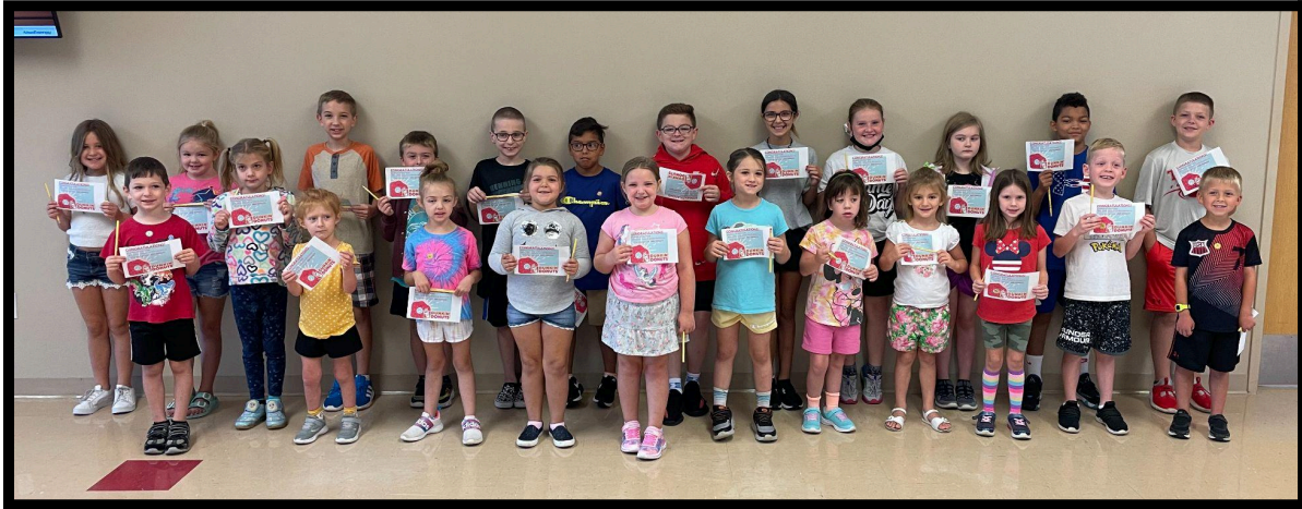
Student of the Week 22-23

Students were treated to a Troy Dunkin' Donut certificate, a pencil, and sticker in recognition of being "Student of the Week."