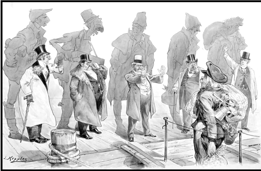
"Looking Backward" ( Puck , 1893)