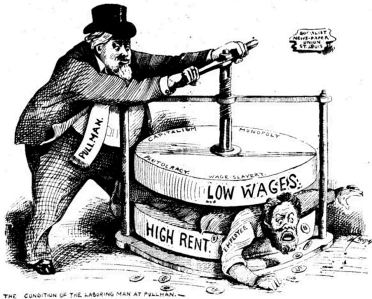
"The Condition of the Laboring Man at Pullman" (Chicago Labor Newspaper, 1894)