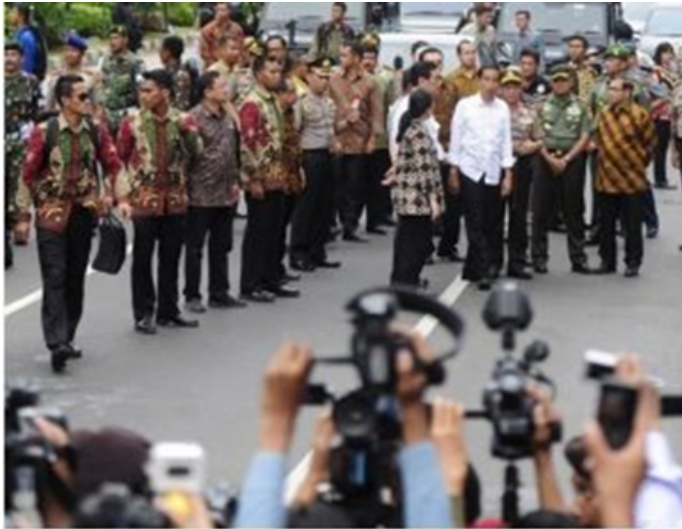
Indonesian President Joko Widodo, center, in white shirt, visits the site of a bomb blast at Tamrin business district in Jakarta, Jan, 14, 2016