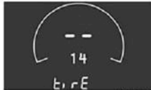
MX101060-UN-17FEB17 14 inch Tire Size Shown

This menu allows the operator to adjust for the tire sizes available. The current setting is displayed on the lower seven segment section when entering the option menu structure.