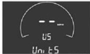
MX101060-UN-17FEB17 English Display Units Shown

This menu allows the operator to select either English or metric units when applicable. The current setting is displayed on the lower seven segment section when entering the option menu structure.