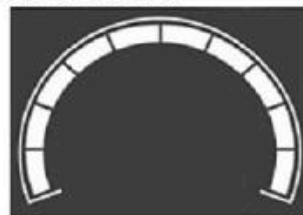
MX101060-UN-17FEB17 Countdown Timer