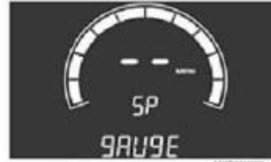
MX101060-UN-17FEB17 Vehicle Speed Option Shown

This menu allows the operator to change the center bar graph to show a graphical representation of either the vehicle speed or engine rpm. On the Home screen, an icon identifies which option is selected. The current setting is displayed on the lower seven segment section when entering the option menu structure. "CYC" identifies the gauge as being in the engine tachometer mode. The "SP" identifies the gauge as being in the vehicle speedometer mode. Both modes show a graphical approximation of the selected mode.