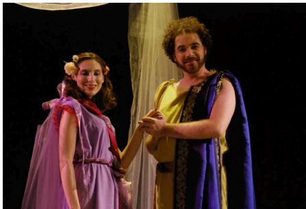
Titania and Oberon back together

In act 5 Oberon and Titania got back together because Titania thought that Oberon had saved her from a hideous monster. Oberon saved Titania from Nick Bottom and he was the donkey. Even though Oberon sabotaged her and tricked her to get the child, she still loved him for some reason. This is how Oberon and Titania came back together as a couple.