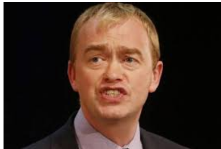
Theseus making his decision

It all started when Hermia and Lysander meet and fell in love. Except due to her father she can't marry him. Egeus wants Hermia to marry Demetrius because he is "wealthier". As time passed they all meet yet again. Here Theseus makes his decision. "These couples shall eternally be knit". Therefore Hermia and Lysander married and moved on with their lives.