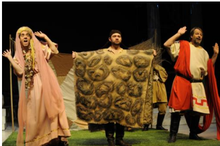
"Pyramus and Thisbe.... and the wall"

Yesterday we saw a play put together by a bunch of workers at Theseus's wedding. Let me tell you, it was quite horrible. Just to give you an idea Bottom was Pyramus, Flute was Thisbe, Snout was the wall, Starveling was Moonshine, Snug is the lion, and Quince is the Prologue. They didn't really know what to do and in the middle of their part they explained what they are, like we didn't know and just made the pity play longer. Worst of all, they had a HUMAN playing a wall! (Snout is the wall right now)"That I, one by name, present a wall". There was also this one part where one of the actors [Bottom] messed up there lines. "I see a voice! Now will I chink To spy an I can hear my Thisbe's face. Thisbe?"