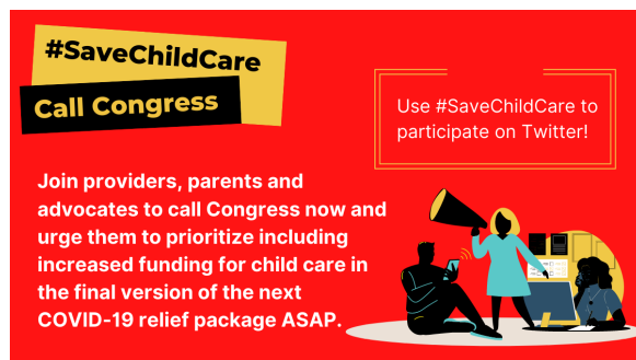
Shareable 4 Link