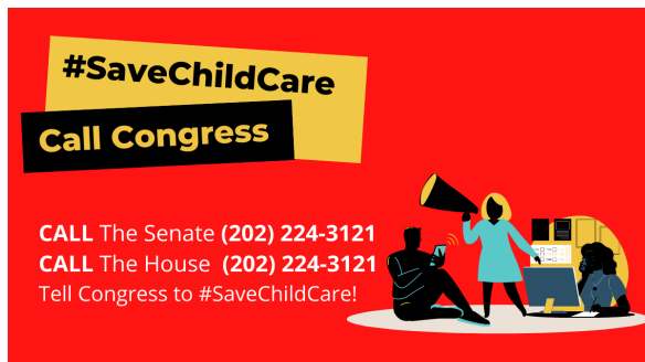
Shareable 1 Link