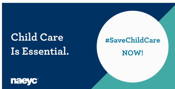
Shareable 6 Link