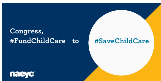
Shareable 5 Link