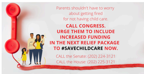
Shareable 3 Link