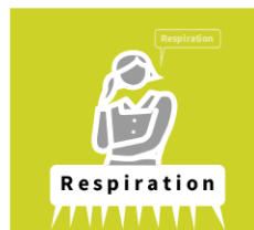
MIX CHORAL & INDIVIDUAL RESPONSES