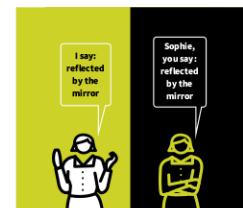
REVISIT & EMBED ORALLY & IN WRITING