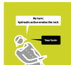
USE SPONTANEOUSLY AS NEW WORDS EMERGE