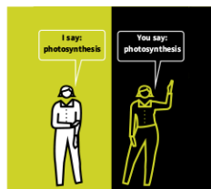
PRACTISE THE ROUTINE