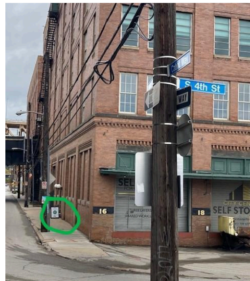
Lower entrance at 4th & McKean St