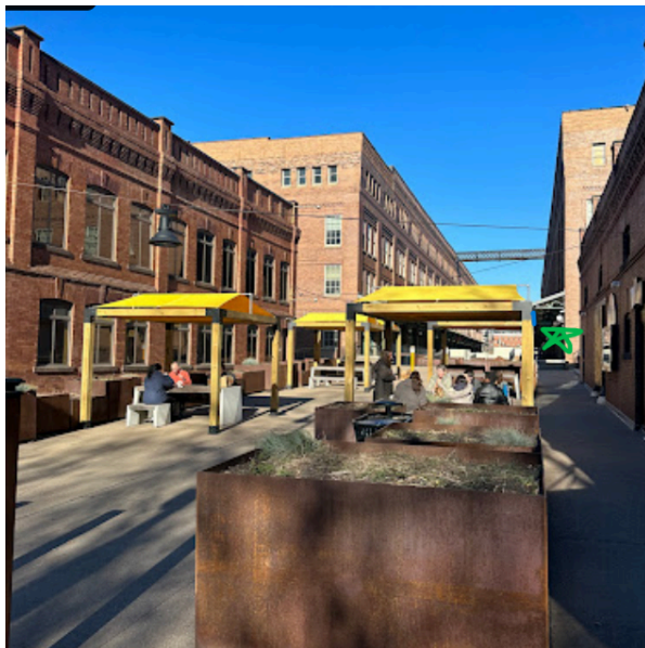
View down Terminal Way from Carson St.

Walk down the pedestrian walkway. The Just Harvest office is located in the building on the right side of Terminal St., inside the first door on the right, marked 16 & 18. Call the site coordinator's cell phone if you are lost on your first visit.