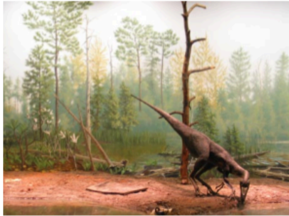
Dilong paradoxus in his native habitat

A defining feature of a dinosaur like Velociraptor was a hole in their hip socket (a Velociraptor was a carnivorous dinosaur closely related to birds). Other reptiles, such as lizards and crocodiles, have legs that sprawl out to the side, with thigh bones almost parallel to the ground. They walk and run with a side-to-side motion.