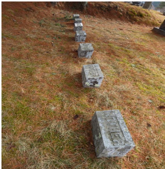
Detail of the seven family foot stones.