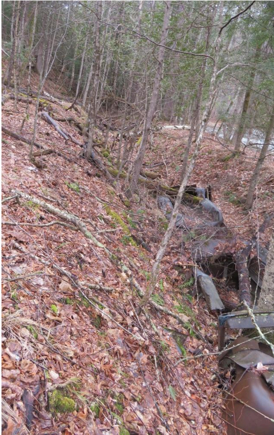
Penstock trench, looking upstream toward intake.