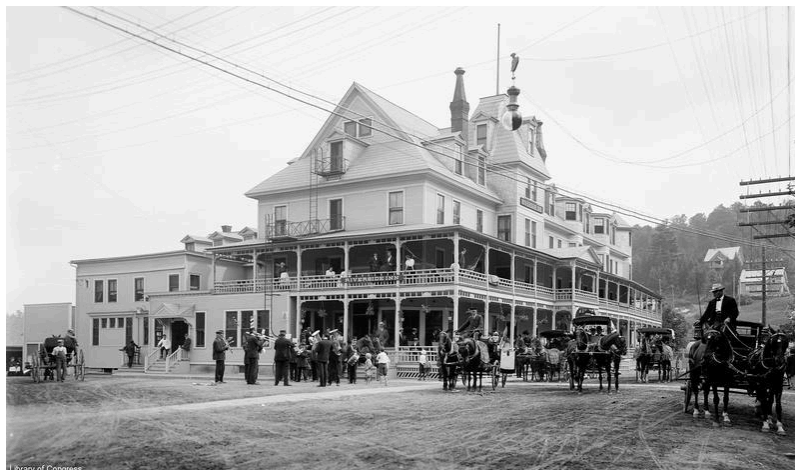
The Riverside Inn from Main St, looking toward Lake Flower