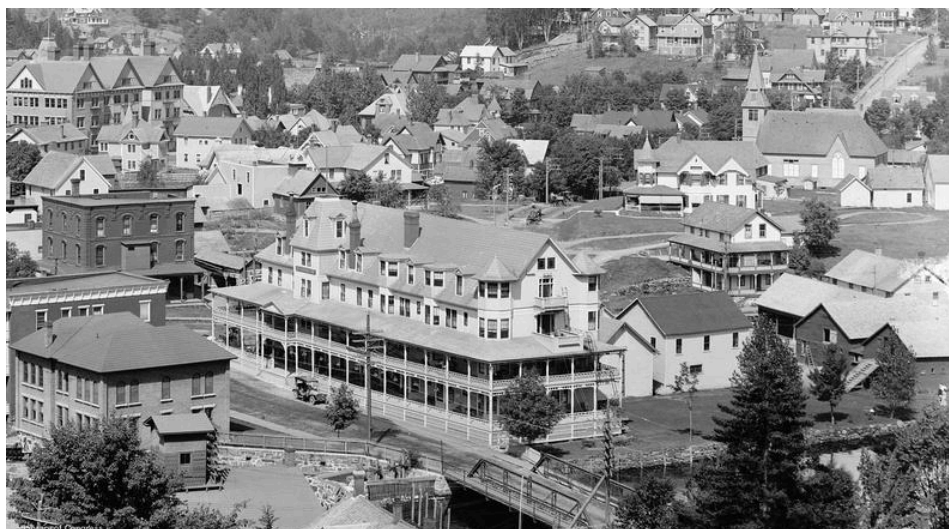
The Riverside Inn from Bloods Hill. The bridge is the one over the dam that makes Lake Flower