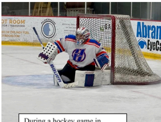
During a hockey game in March 2025.