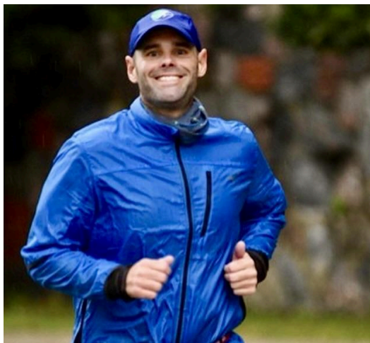
Running during Ironman Wisconsin