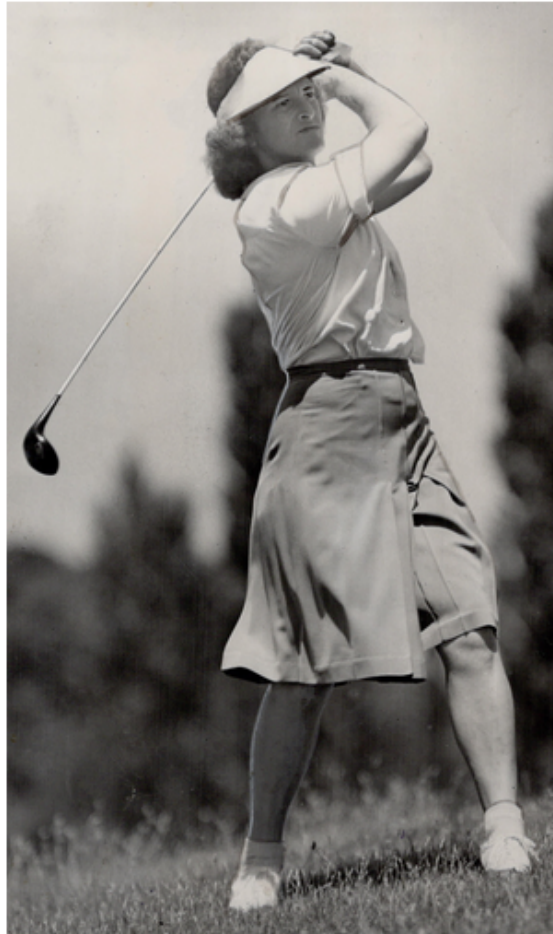
Babe Didrikson Zaharias, 1948

The nation's most prominent mid-20th century woman athlete was Babe Didrikson Zaharias . A multisport star in track and field events (shot put, hurdles, and high jump), baseball, and golf, she set numerous records in different sports and could outperform males in each ( About "Babe" Didrikson Zaharias ).