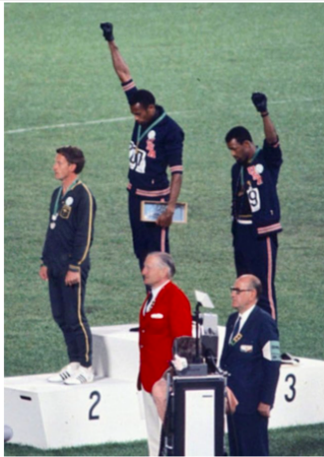
American sprinters Tommie Smith & John Carlos, 1968