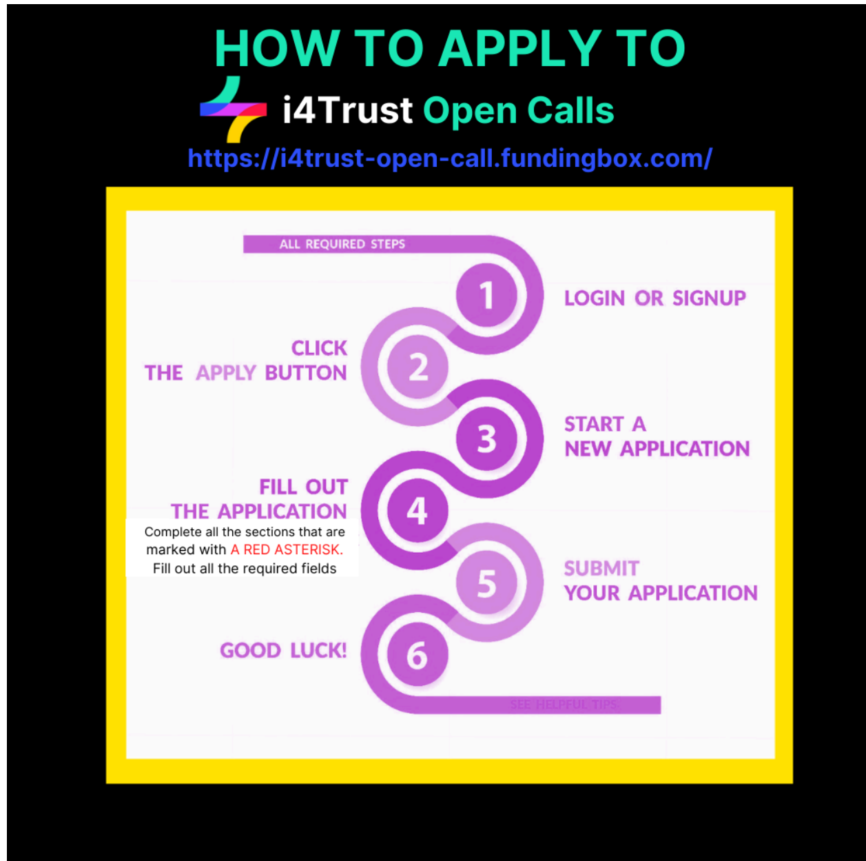
Figure 1 i4Trust How to apply

After the proposal is submitted, applicants will be able to modify the form until the deadline. As such, applicants are encouraged to submit their forms as early as possible, prior to the deadline.