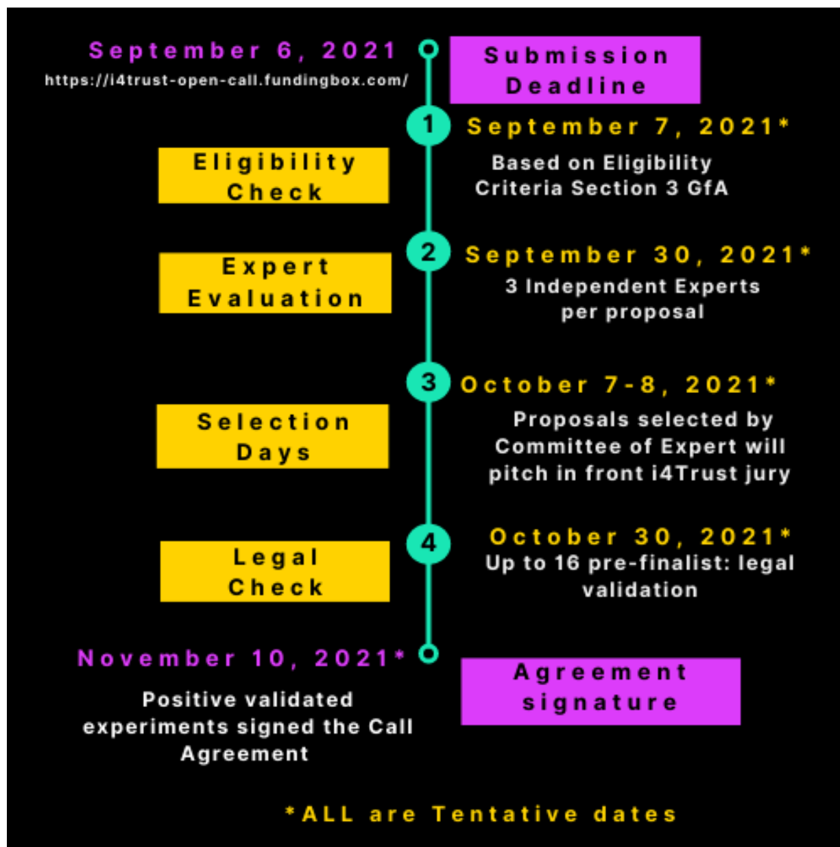
Figure 2 i4Trust Selection and Evaluation process