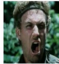
Strike Commando/Review - The Grind... grindhousedatabase.com