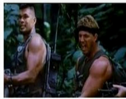
Scream Heard ... allisonswrittenwords.blogspot.com