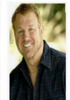
Scream Heard ... allisonswrittenwords.blo...