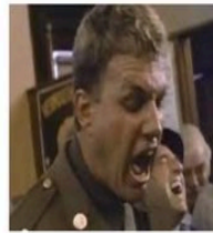
Scream Heard ... allisonswrittenwords.blogspot.com