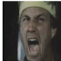
Comeuppance Reviews: Strike Comman... comeuppancereviews.net