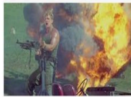
Film Monthly.com - Mercenary Fighters ... filmmonthly.com