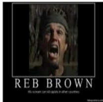
REB BROWN His Scream Can Killrapists ... me.me