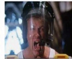
Reb Brown | Tranquil Tirades Wiki | Fandom tranquiltirades.fandom.com