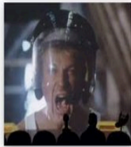
Reb Brown (Creator) - TV Tropes tvtropes.org