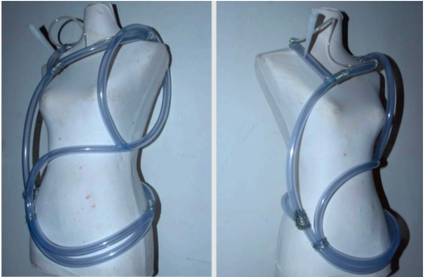
nuclear gear™, 2024–2025 — PVC tubing, wire (front and side views)

looming future · sculpture / installation — wood, wire, thread, electrical cable 2026 · Santa Cruz, CA