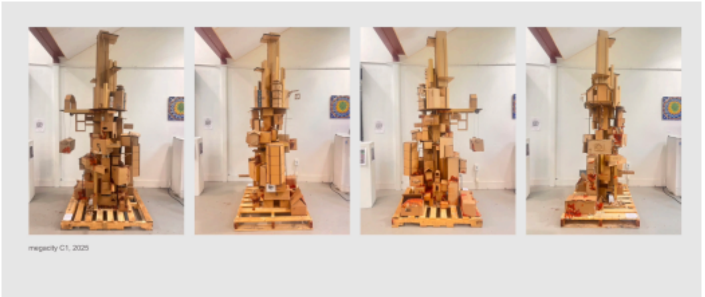
megacity C1, 2025 — cardboard, found materials, pallets