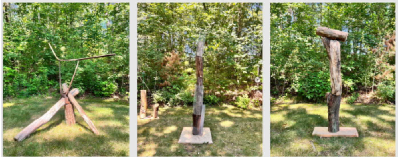
Untitled outdoor sculpture series — logs, found metal, reclaimed wood

Site-responsive works using raw timber and salvaged metal. Each piece negotiates balance and tension between heavy, natural materials and the landscape.