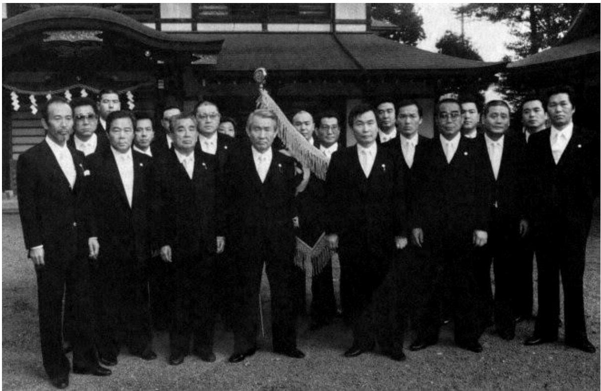
The Yamaguchi-gumi during its reign in the 1980s

Being Part of the Yamaguchi-Gumi is an honorable position to be in, when you get put in you are seen as a family member that goes deeper than blood. The Yamaguchi-Gumi have each other's back, greed and selfishness is looked down upon. When you take the oath to become Yamaguchi you take a sacred oath to protect those around you including the average working man.