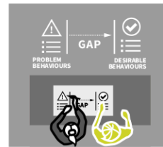
ESTABLISH PROBLEM & TARGET BEHAVIOURS