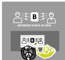
REINFORCE STUDENT OWNERSHIP & AGENCY