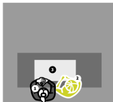
RECORD AND PLAN WITH THREE-POINT COMMUNICATION