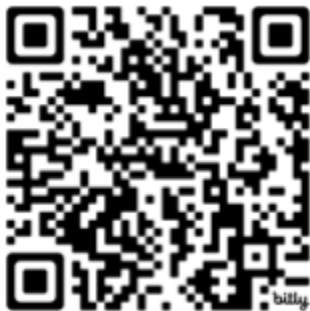
LETTER CAMPAIGN QR CODE