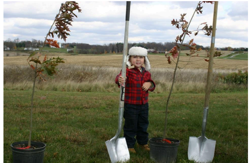
WOSU Public Media