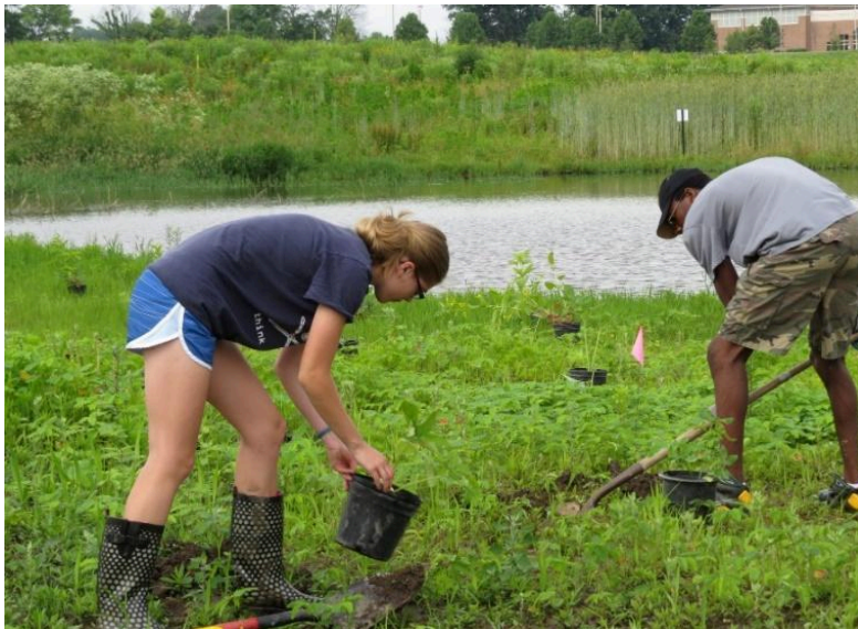
Legacy: A LandLab Story - YouTube