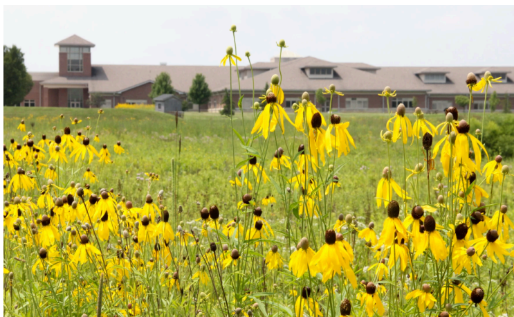
Wildflowers bloom in the prairie in front of Granville Intermediate School.