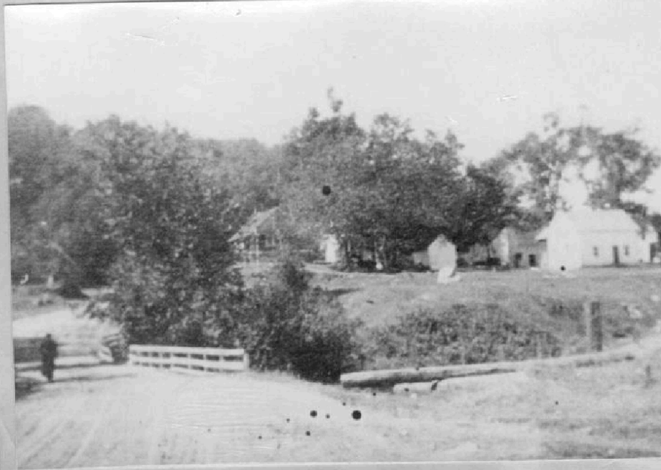
The Chamberlin farm on Chelsea Creek 1908