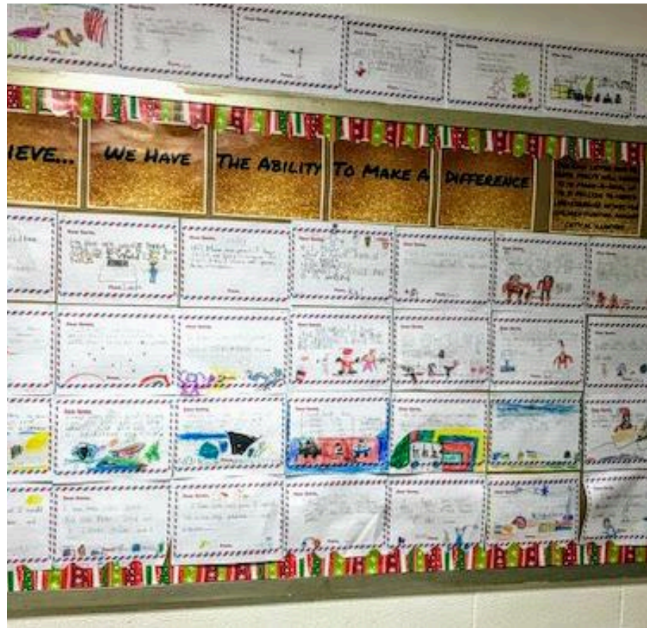
Above: Student letters on behalf of the Make-A-Wish Foundation are displayed on a bulletin board.