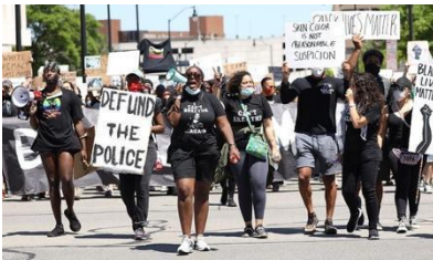
Rochesterians protesting in support of the Black Lives