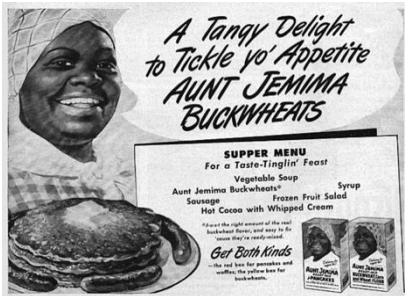
Aunt Jemima newspaper ad.