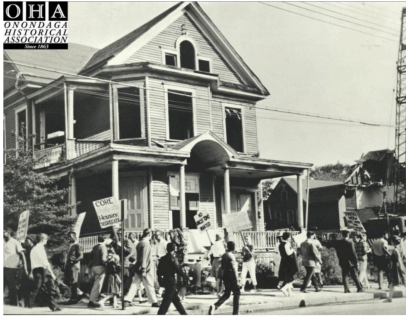
Protesters march through the 15th Ward