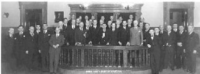
Monroe County Legislature in 1939/40 voting on racist deed restrictions on the homes sold to developers

How is my cultural identity impacted by systemic racism? Or, how are people whose cultural identities that are different from mine impacted by structural racism?