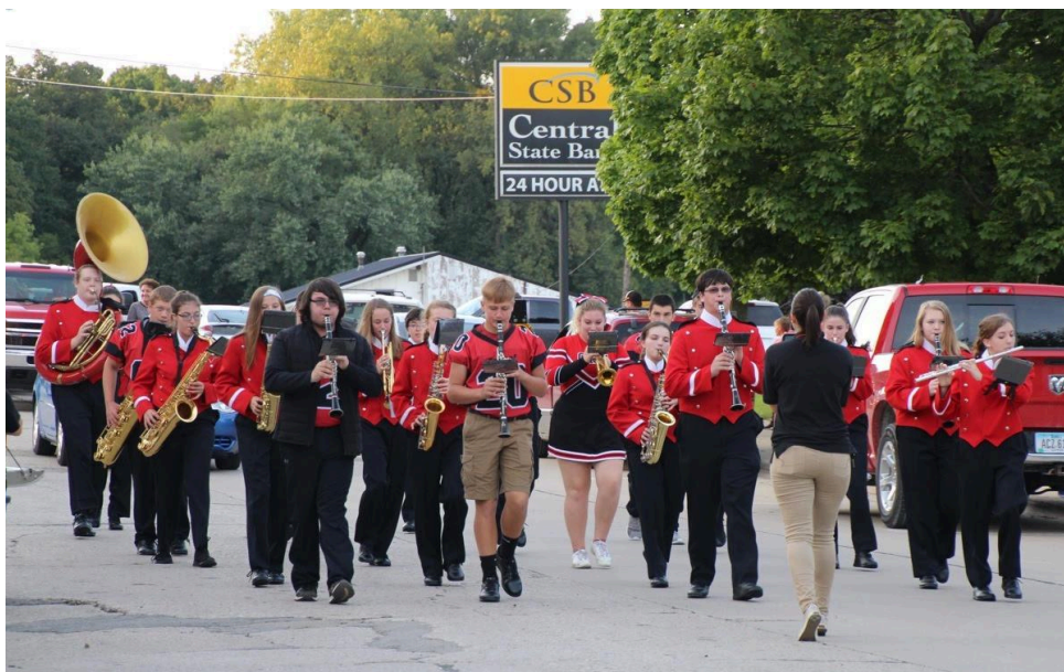
Students marching in the 2019 Homecoming Parade

Congratulations to the High School marching band on spectacular performances at the 2019 Homecoming pep rally, parade, and Homecoming game!