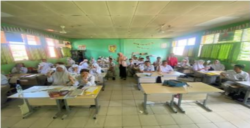
Figure 1. Sample