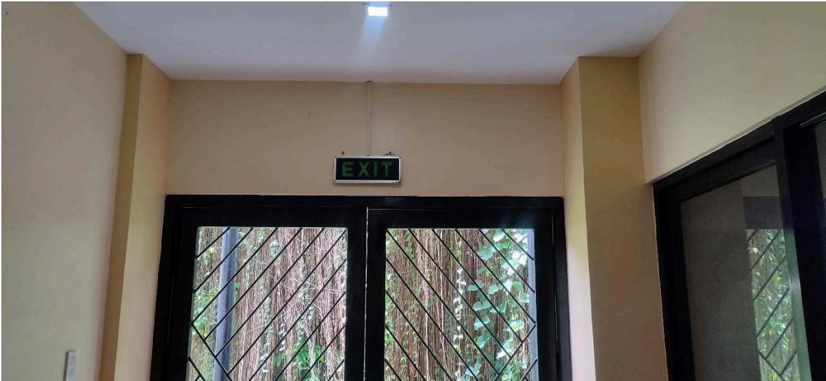
WELL LIGHTED EXIT POINTS