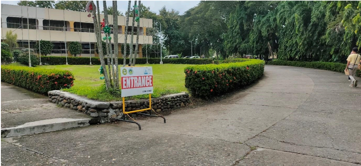
ENTRANCE/EXIT FOR MOTORIST