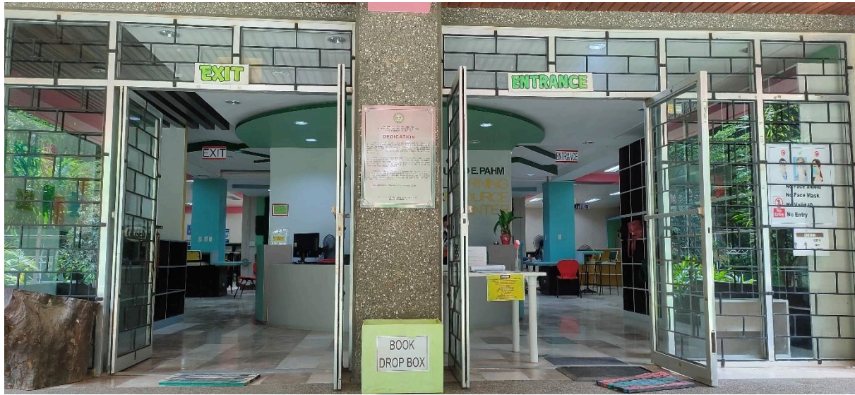
ORGANIZED ENTRY EXIT POINTS