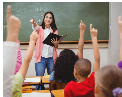
Figure 2. Attached figure in article