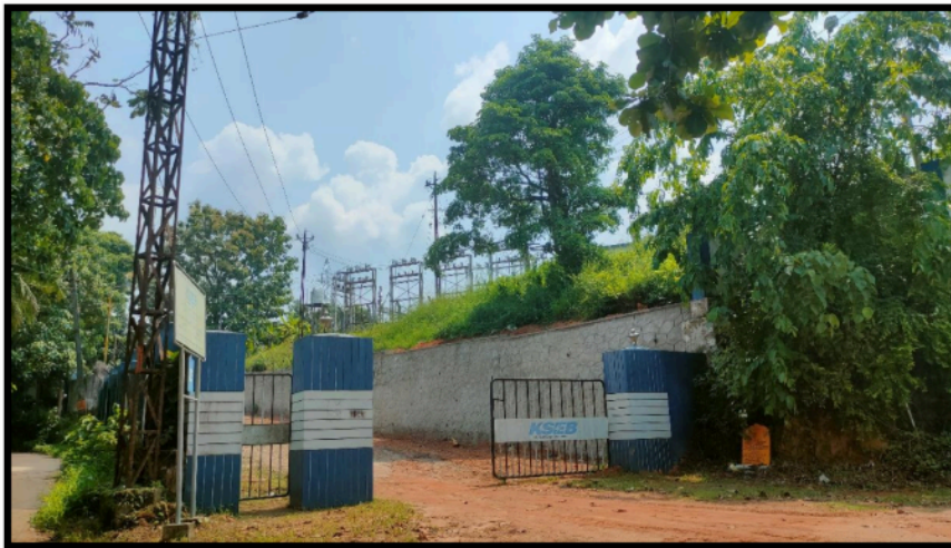
Edamon 220kV Substation, Kollam

5 students of S5 have attended internship at 220 KV substation ,Edamon, Kollam, which helped them to experience working with electrical equipment, systems, and controls found in substations. It helped students to get in-depth knowledge about power switching and transmission systems. Overall, it helped students to bridge the gap between theoretical knowledge gained in academic settings and practical applications in real-world substation environments, reinforcing understanding and competence.