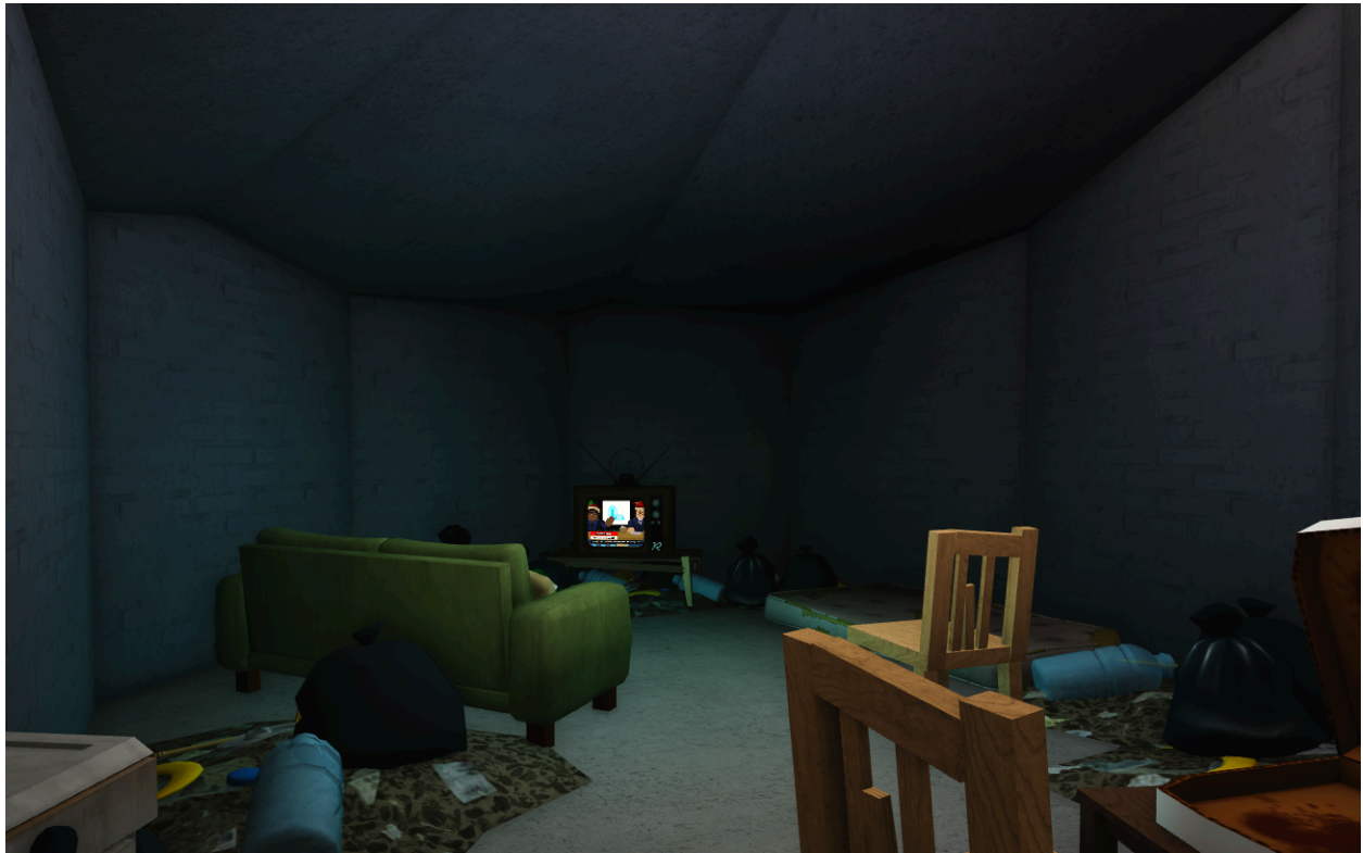
Caution tape surrounding perimeter possible TV to be see new news reporter one of a kind broken chairs known residents red elf 2025