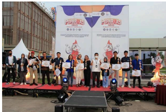
Figure 1. The Energy of The POPARNAS 2023 at Palembang Tourism of Polytechnic

Figures' captions are numbered and positioned below the image/graphic, quoted sequentially, typed in capital letters, and followed by a period. Figures' caption must be in Times New Roman font 9 points, 1.15 spaces with no space before and after the paragraph, consist of more than two lines. Captions of single line must be centered whereas multi-line captions must be justified. Numbers must be set to have a good contrast quality. The following is an example of writing images, tables, and graphs: