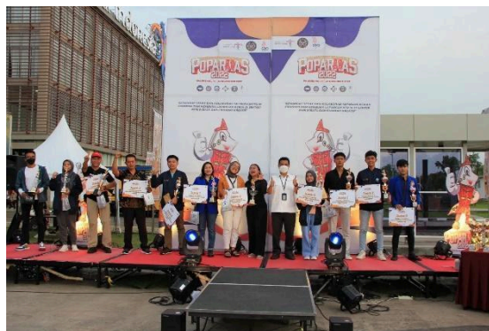
Figure 1. The Energy of The POPARNAS 2023 at Palembang Tourism of Polytechnic

Figures' captions are numbered and positioned below the image/graphic, quoted sequentially, typed in capital letters, and followed by a period. Figures' caption must be in Times New Roman font 9 points, 1.15 spaces with no space before and after the paragraph, consist of more than two lines. Captions of single line must be centered whereas multi-line captions must be justified. Numbers must be set to have a good contrast quality. The following is an example of writing images, tables, and graphs: