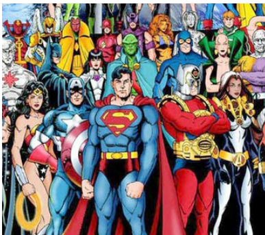
Super heroes (article)

Historical Examples, choose one artwork from a list of selected works (images/articles)