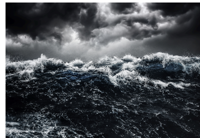
Power of Nature