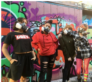
Graffiti camp for girls