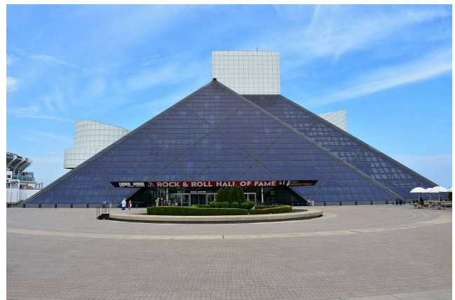
The Rock and Roll Hall of Fame, Cleveland, Ohio. Front/Entry View