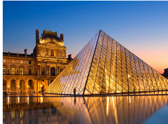
Louvre's Pyramid, Paris