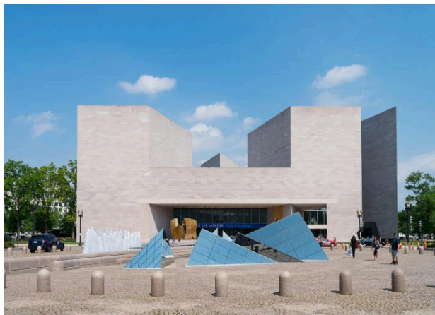
National Gallery of Art-East Building, Washington D.C.