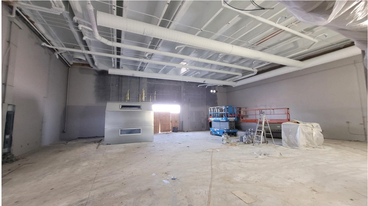
Woods room with Paint booth