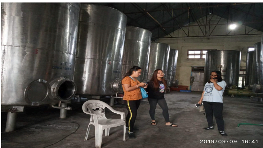
Pic: Interaction with the Manager

Before the revision of the 1997 Act, grapes were being sold as table fruit or pressed for juice. The winery is operated under Government of Mizoram supervision and under current regulations production must be consumed in Mizoram.