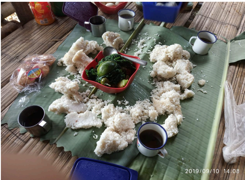
Pic: Lunch in the traditional style

The main occupation of the people in the village was agriculture. Grapes are the most important crop grown in the area, as it is the state's largest grape-producing region. Rice, ginger, and other crops are also grown in the village.