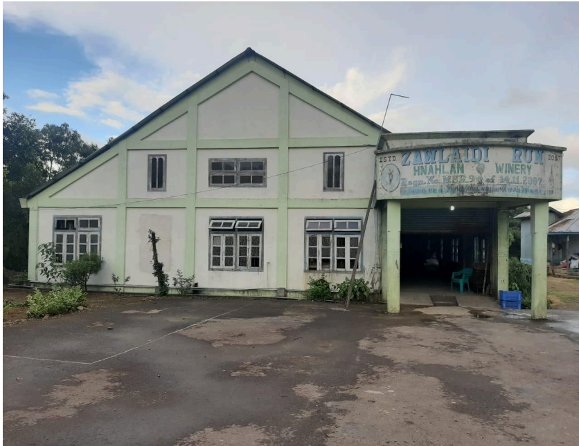
Pic: Hnahlan Winery

After a quick wash and a cup of tea, the group set out for Hnahlan Winery. The Hnahlan Winery Ltd was established in 2007. It became operational in 2010 after the Mizoram Government had revised the Liquor Total Prohibition Act 1997.