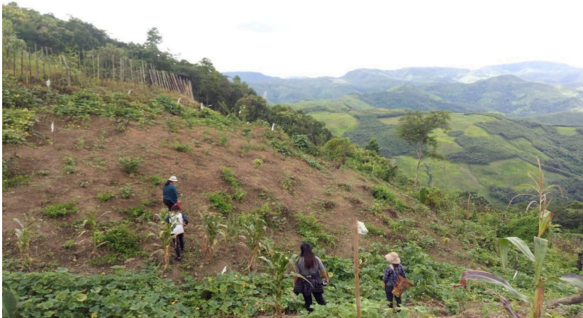
Pic: Collecting Vegetables

We departed the village at 5:00 PM and reached home safely at 8:00 p.m. This trip was unforgettable. Not only was it learning experience, but it was also a fun and relaxing break. It was a new, interesting and informative experience for all of us.