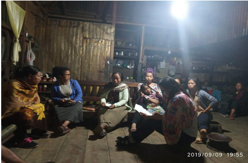
Pic: Interaction with Local Self-Help group members

After dinner, we have interactions with members of several Self-help groups in the village. The topic of the discussion was on the functions and importance of self-help groups in improving women's economic status.