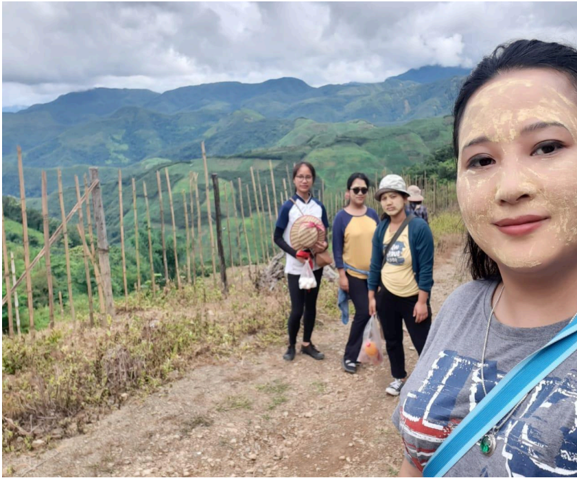
Pic: On our way to the farm