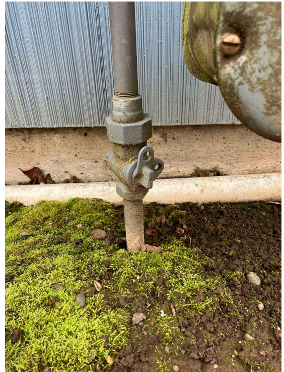
Gas shutoff valve on the gas meter. The gas meter is in the backyard on the NE corner of the house.