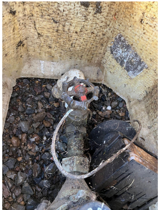
The water shutoff valve is inside the water meter box on the street.