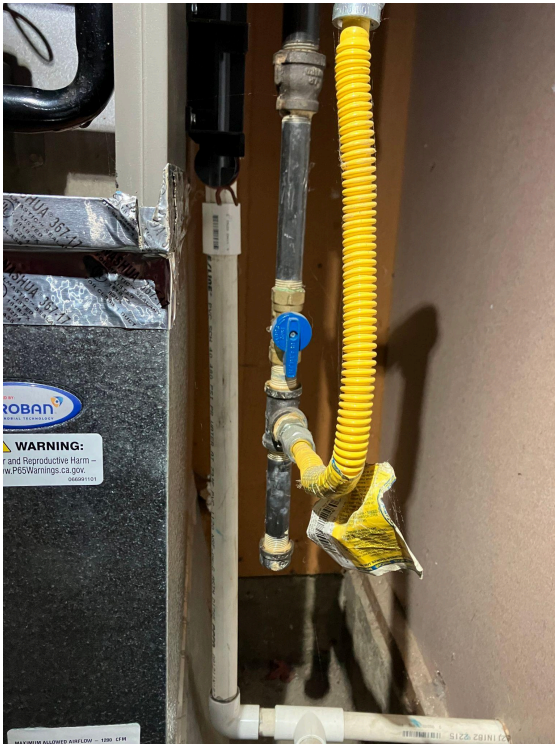
Gas shutoff valve (blue) on the furnace.