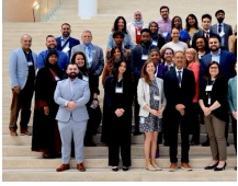
The Civic Youth Fellowship Program - building the next generation of community leaders & public servants

We're young, ambitious and building something extraordinary. Located on Treaty 6 Territory and with a population of just over one million, Edmonton is one of Canada's youngest, fastest growing and most affordable cities. We're building a resilient and diverse economy, attracting the best and the brightest and striving to be a world leader in environmental sustainability. We value quality of life, community safety and a welcoming spirit that embraces new people and new ideas.