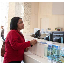
The City of Edmonton provides a number of services to welcome and help newcomers settle into Edmonton quickly.

780-423-4567 - Non-emergency calls to Edmonton Police Service, including crime prevention, maintenance of social order, law enforcement and public safety through community policing.