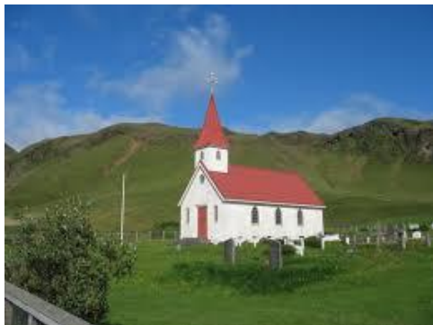
A regular Liberan church

The Liberan churches are built by hand, not machine. They come in many different looks, though they always have the common steeple on top, which Liberans believe channels their prayers to God better. The churches are also laid out differently than others. Instead of a priest being in the front and directing people in benches, there are stall-like areas separated by low walls on each side of the church (3-4 on each), with windows at about chest level. It makes it so that when kneeling in prayer, you can look up through the window and to the sky to focus on God.