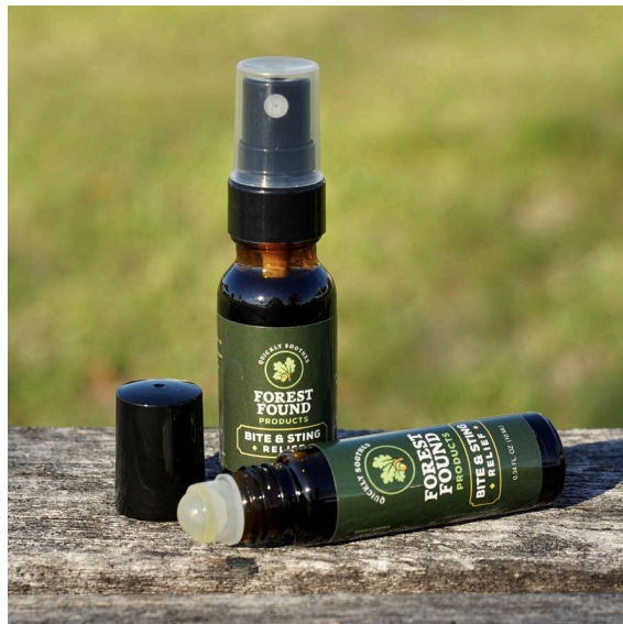
14th March, 2026: One of the first product photos for the website.