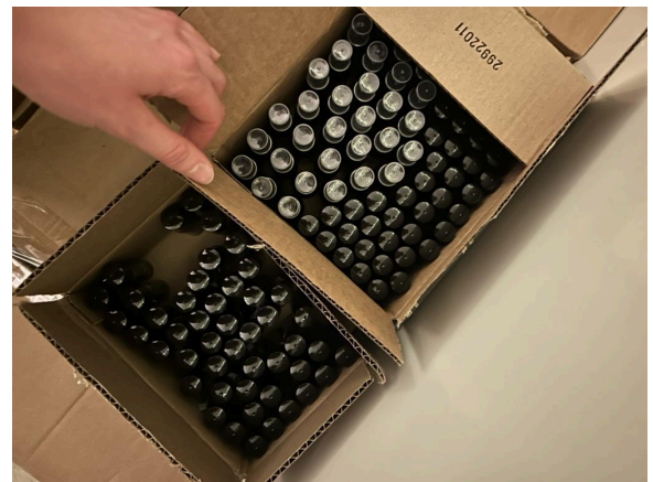
6th April, 2026: Some of the first bottles, ready to be shipped for preorders.