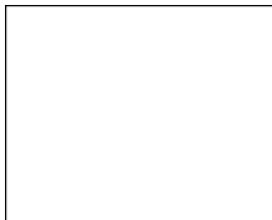
Figure 1. This is a figure. Schemes follow the same formatting. Figures may have a footer.