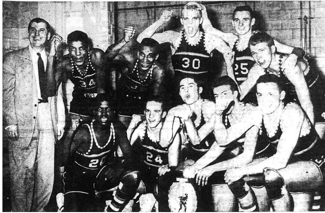
(Above, the team celebrates their Super-Sectional win)