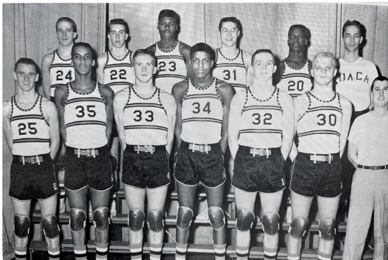
1955-56 Boys Basketball Team