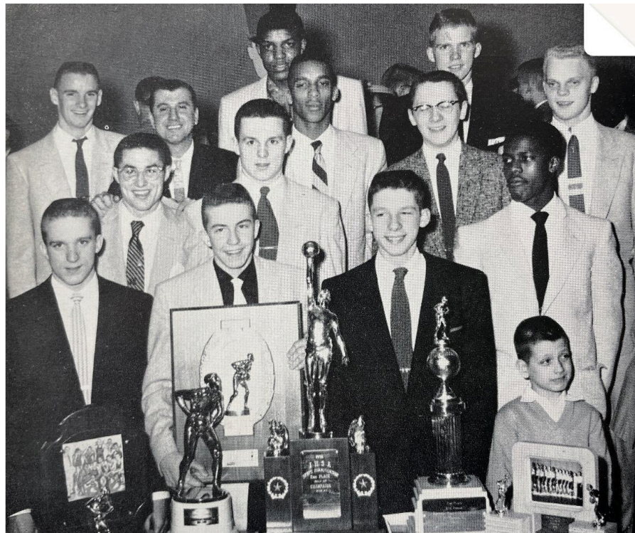
(Above, the boys pose at their team banquet)