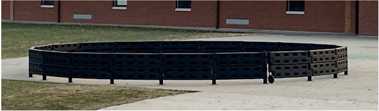
*Gaga Ball Pit*

* STEAM supplies * Chromebooks for classroom use * Treats for our teachers and staff