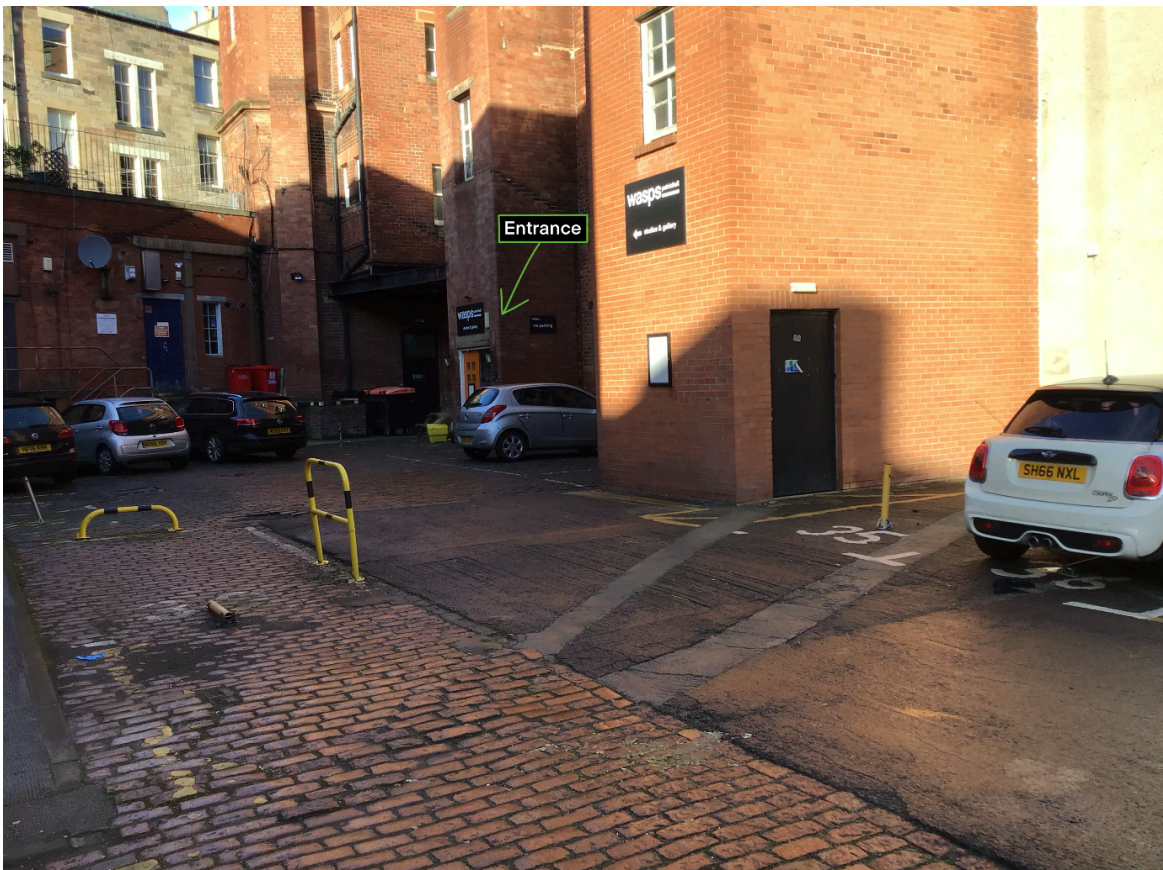
et voila! You have reached the gallery