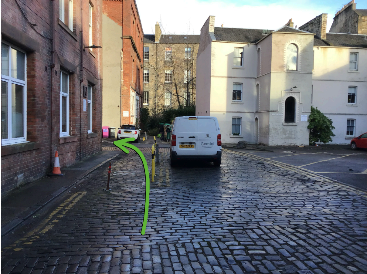
Turning left again