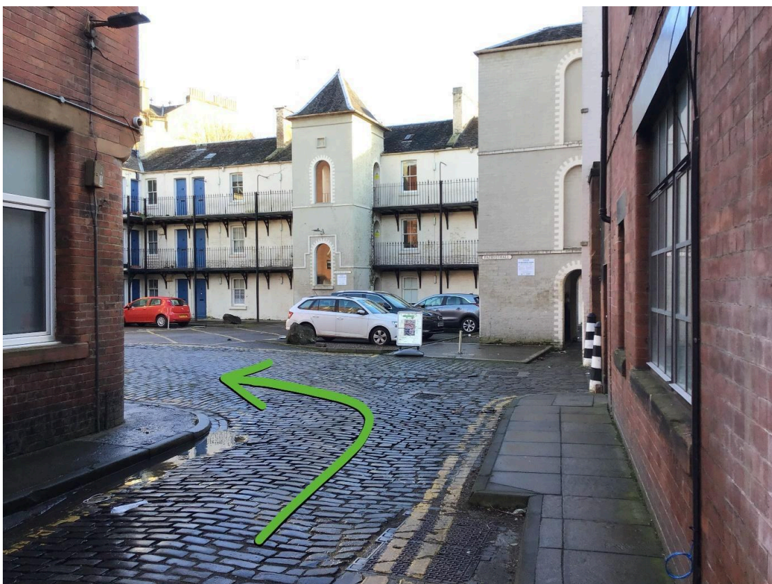
Turning left at the bottom of the lane