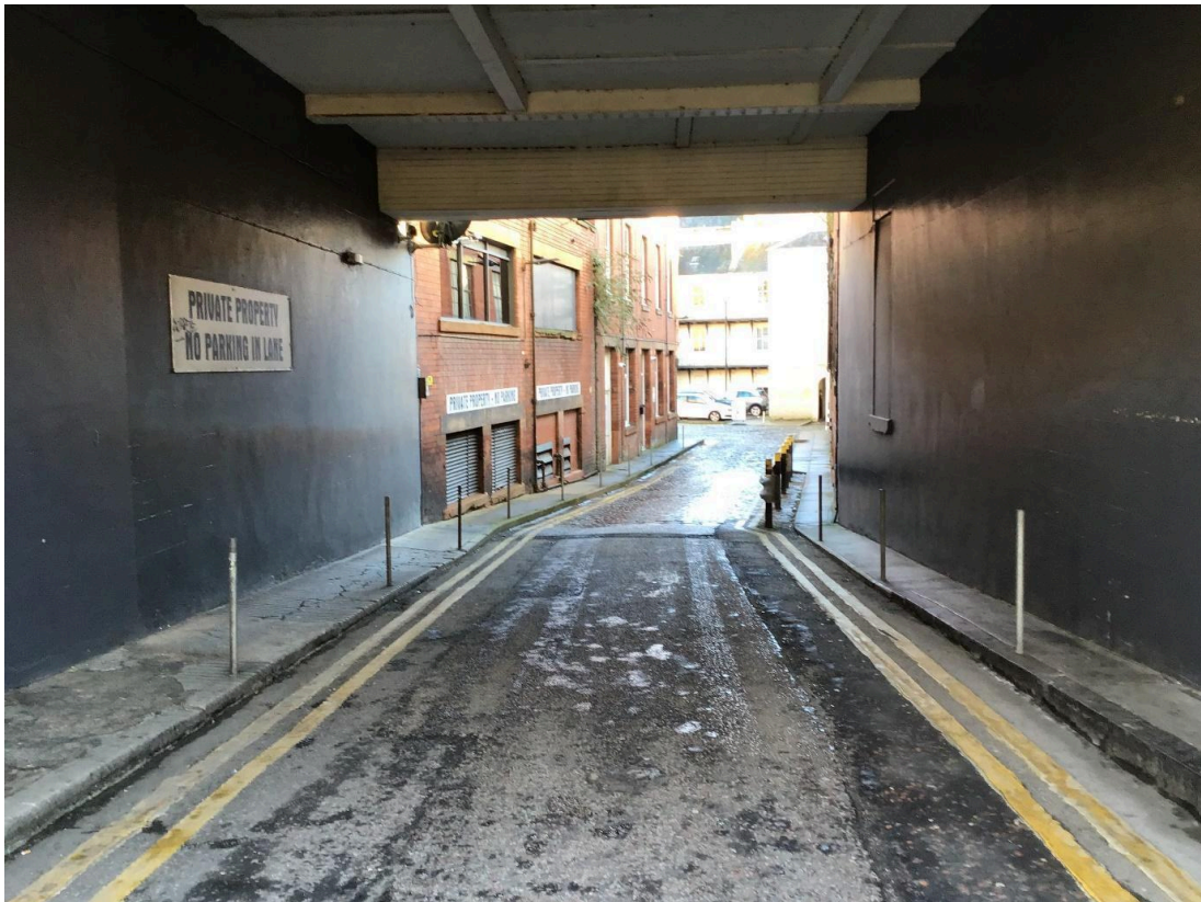
Going down Patriothall from Hamilton Place